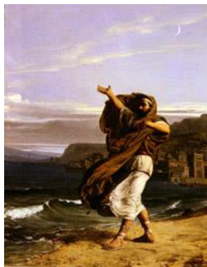
Demosthenes Practising Oratory (1870)

This Project is something with which you should be able to have fun .